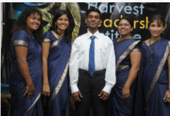
This is a ministry that is educating and using some of the most dynamic young Christian leaders in South Asia. HLI is making a huge impact in Sri Lanka and beyond.

Harvest Leadership Institute (HLI) is a dynamic Bible training center equipping a new generation to serve through evangelism, church planting, and in the marketplace. The goal is to train pastors and five-fold leaders to go into all the major cities and villages of Sri Lanka. HLI uses modular training programs taught on holidays, weekends and some evenings. Classes are both in-person and online (due to the pandemic). Students include pastors, evangelists, workplace leaders, prayer warriors and maturing believers.