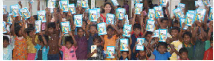
(Left) One of the many families who have been impacted in rural areas of Sri Lanka through gifts of tube wells. (Above) Bible storybooks are important to the children's ministries. They are treasured by those who have been fortunate to receive them.