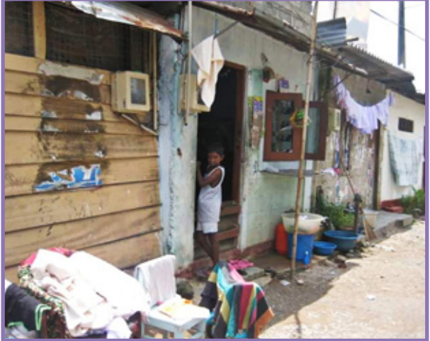
The team goes into the Sri Lankan slums to feed children and families.

The team we partner with in Sri Lanka is remarkable in their faith, commitment, dedication, and desire to share the Gospel while also meeting the needs of the least of these. In a place where Christians are often a persecuted minority, this team boldly marches into the mission fields proclaiming the Good News. Over several decades they have created a multi-faceted outreach that has dug wells in rural areas, built a magnificent children's home in the nation's capitol, undertaken extensive programs for youth in the slums, and continually feed the impoverished in several locations. Their main church is growing exponentially, has an extensive online presence, and helps sponsor youth rallies where young people are eagerly accepting Jesus. And their Bible distribution programs have reached thousands.