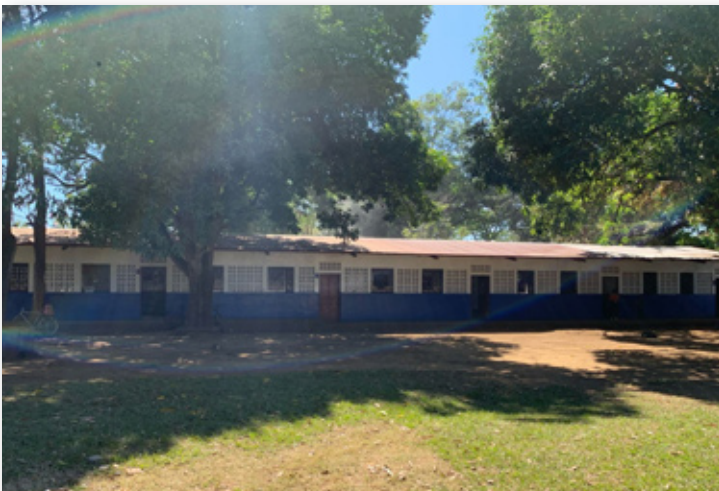
A side view of the school building

The old white boards in the classrooms are simply worn out. We need eight new ones.