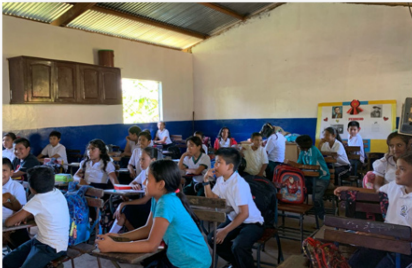
These excited students are eager to learn.

The government requires school children to wear uniforms and poor people simply cannot afford to buy them. THE COST TO PURCHASE SHIRTS, PANTS OR SKIRTS, AND SHOES FOR ALL THE CHILDREN IN THE SCHOOL IS $6,250.00. TO PURCHASE ONE UNIFORM IS $35.00 AND A PAIR OF SHOES IS $20.00.