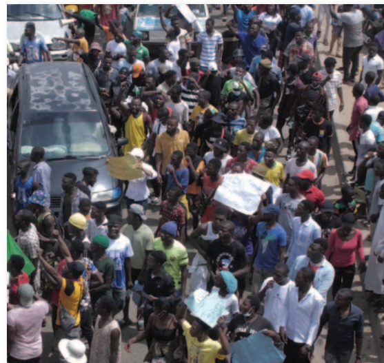
Gangs are roaming streets spreading hate and violence.

Our courageous Native Missionaries have not backed down. Rather than retreat in the face of persecution, our people have stood firm and rededicated themselves to being the light of Christ in even the darkest of times. In that role, they have continued to share the gospel, feed the hungry, comfort those who have lost loved ones, and educated poor and orphaned children. In the midst of persecution, new water projects have begun, schools have expanded, churches have remained open and have been filled with those hungry for faith, hope, and growth, and our feeding programs have reached countless people who have fled violence. Yet, much more needs to be done.