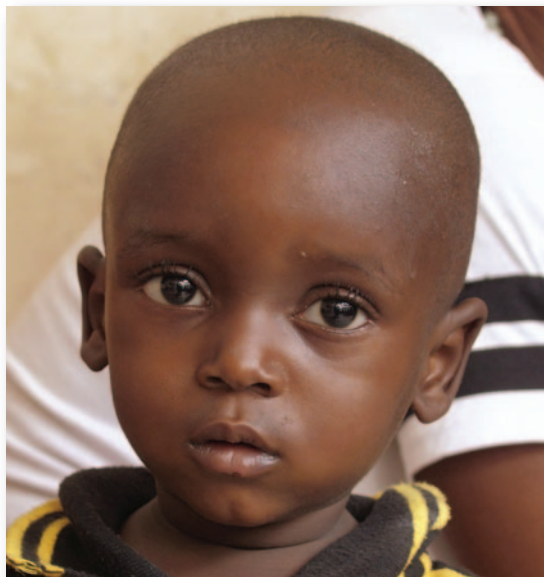
Children have been orphaned or separated from their parents.